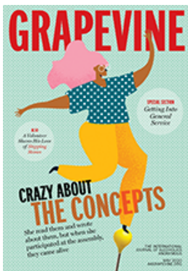
May 2020 Issue